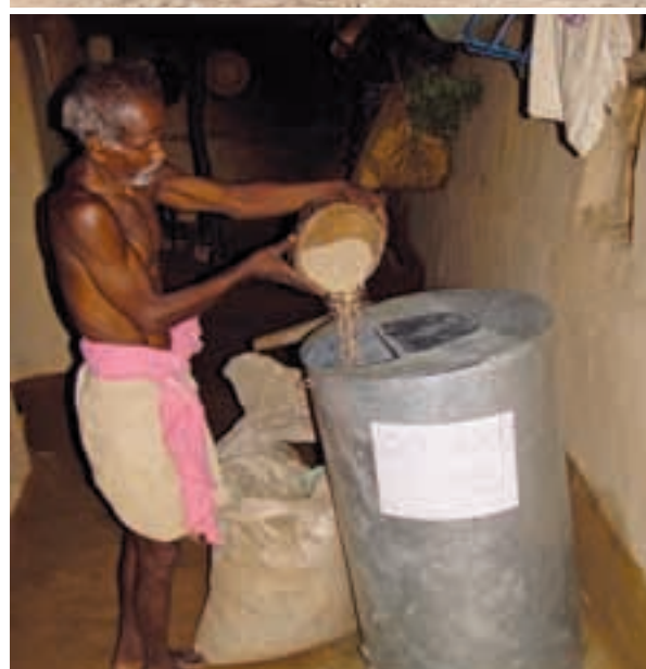
Food security through: Backyard poultry Improved livestock Better storage